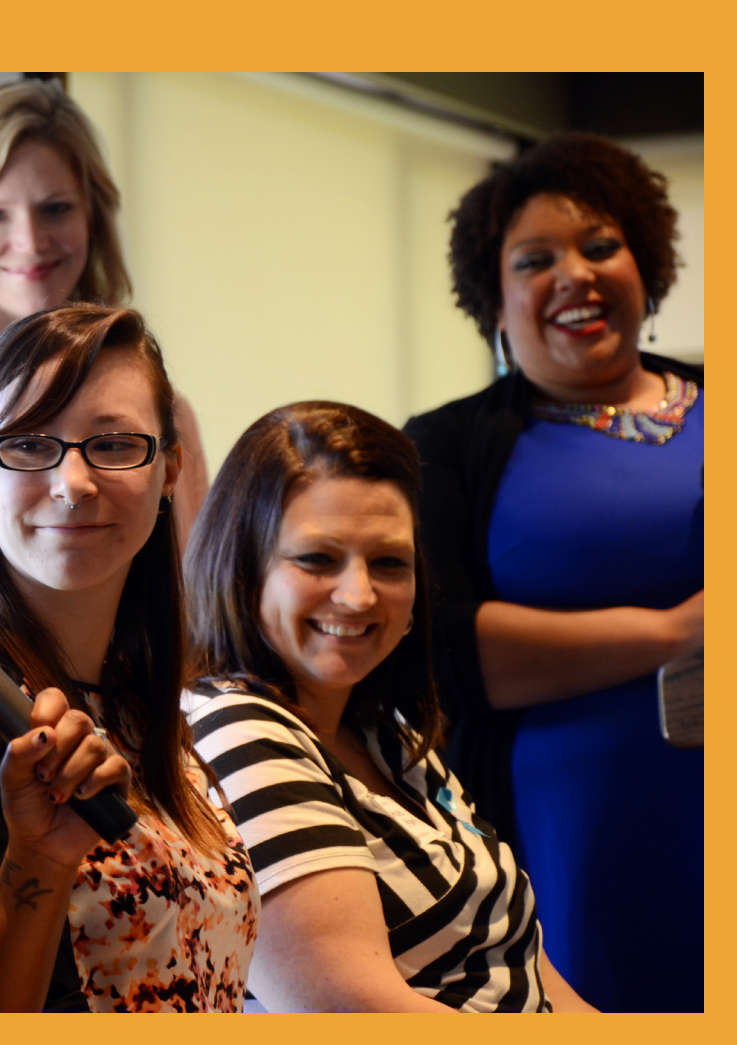
ts at a Fostering Success Michigan Statewide Summit support support students in their transition to college.

Other opportunities to expand access and successful completion of college for young adults with experience in foster care are embedded in other broad policy areas focused on self-sufficiency. For example, two of the primary policy areas that fit this category are food and cash assistance. First, the Supplemental Nutrition Assistance Program (SNAP) can provide food