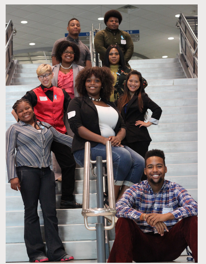
Student leaders at the 2016 Michigan Young Leader Advocacy Summit

Integration of Approach in Programming. The great challenge of campus-based support programs is to design services and support strategies that comprehensively address the complex web of challenges across the Seven Life Domains as outlined above. Despite these dynamic issues, solutions are beginning to emerge at policy and program levels. At the policy level, there is recognition that young people from foster care need supports across multiple life domains. Efforts continue to bring awareness of the need to cross-reference differentiated federal programs to improve coordinated service delivery at the state level to support successful transition from foster care to college. At the program level, it is too early to tell which models of support are most effective in creating college experiences not