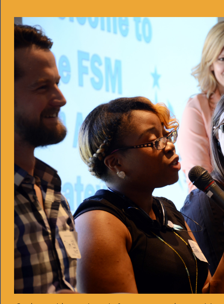
Students with experience in foster care speak to participan about the need to develop interdependent relationships to

Within general foster care policies, the Title IV-E section of the Social Security Act ensures categorical eligibility to federal funding to states in the provision of foster care services. This includes support services aiming to improve outcomes in any domain deemed critical to safety, well-being, or permanence. States are reimbursed by the federal government for allowable expenditures without regard to the number of youth in care. In 2008, this categorical eligibility was extended to include youth up to age 21 through the Fostering Connections to Success and Increasing Adoptions Act (P. L. 110-351). This updated law expanded categorical payments to include transportation to school and required each case plan to include completion of secondary education and verification of school attendance. Within this framework, state government agencies are encouraged to identify programmatic